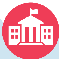
State and Regional Levels