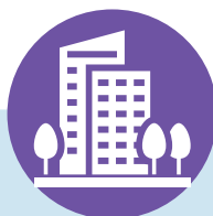
Urban and Peri-urban Levels