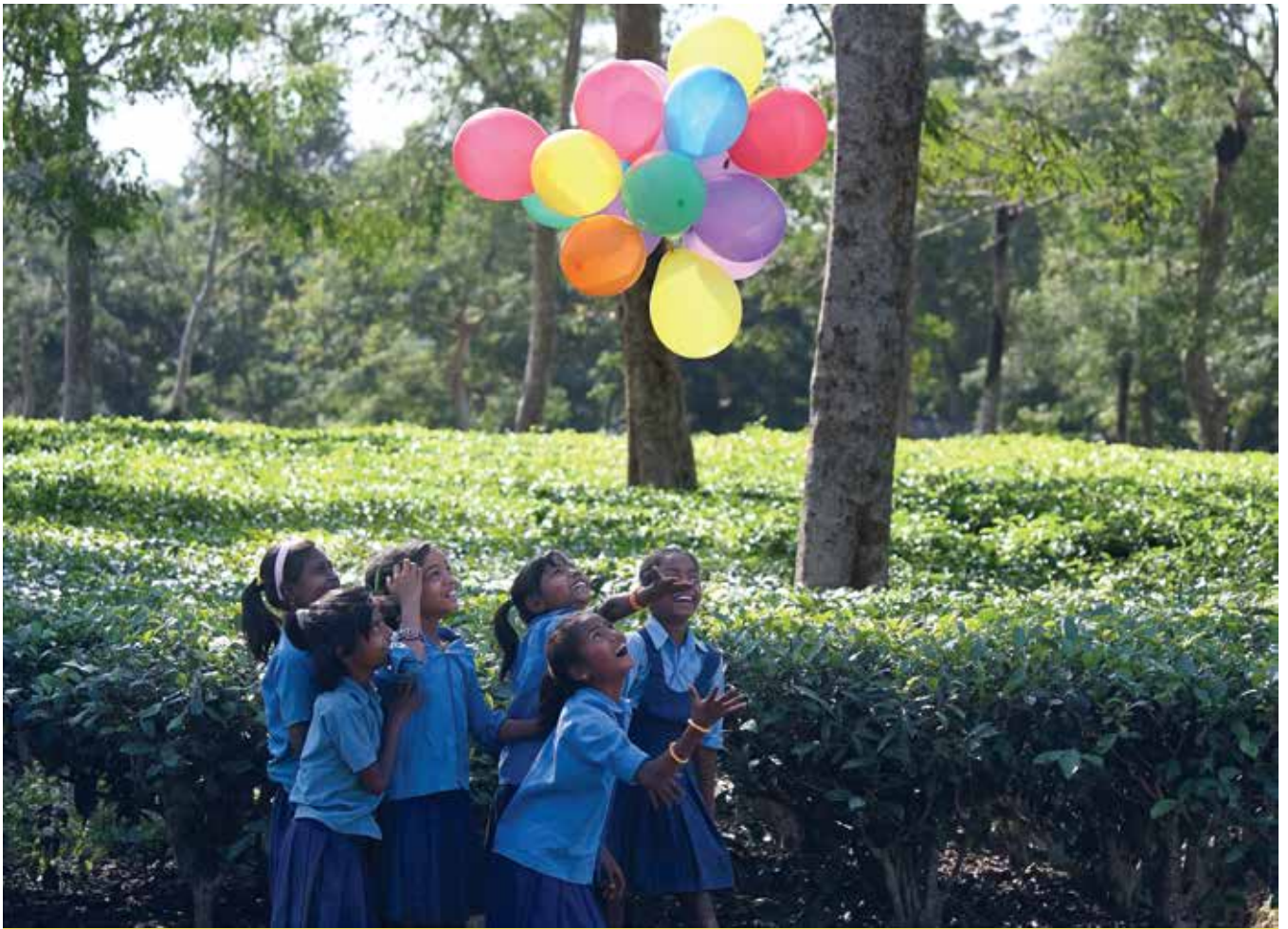
Online portal for scholarship for students of Tea Tribe Community