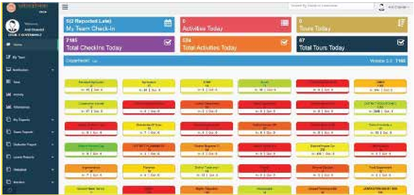
Snapshots from the Loksewak App