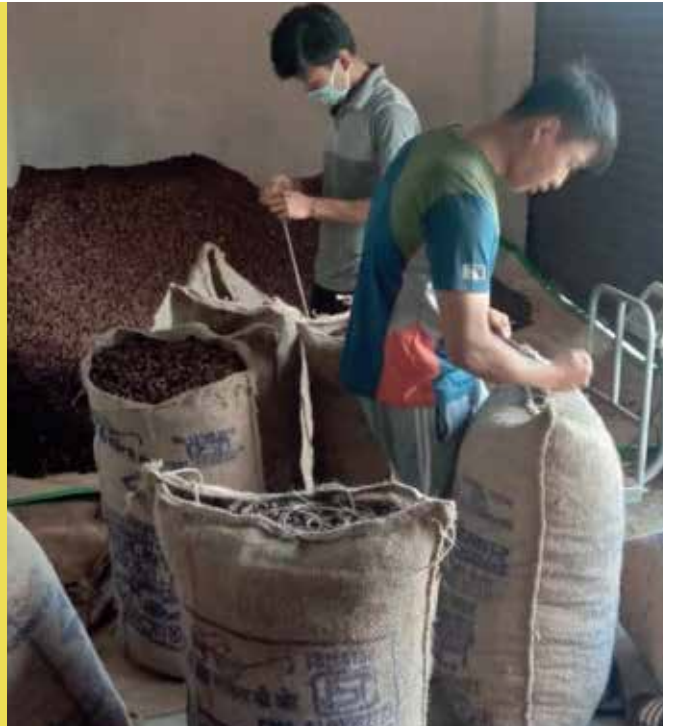
Packing of Dried Large Cardamom Capsules