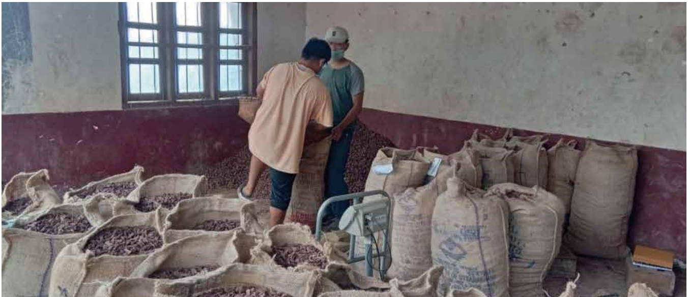
Collection of Dried Large Cardamom Capsules